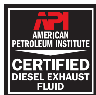
a. PMS 1797 and black